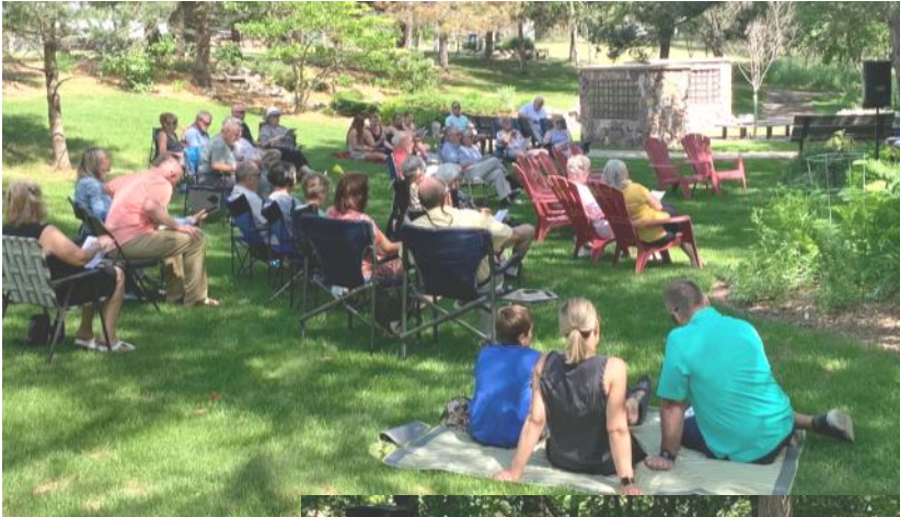
Beautiful day for Outdoor Worship in the Memorial Garden on June 19th.