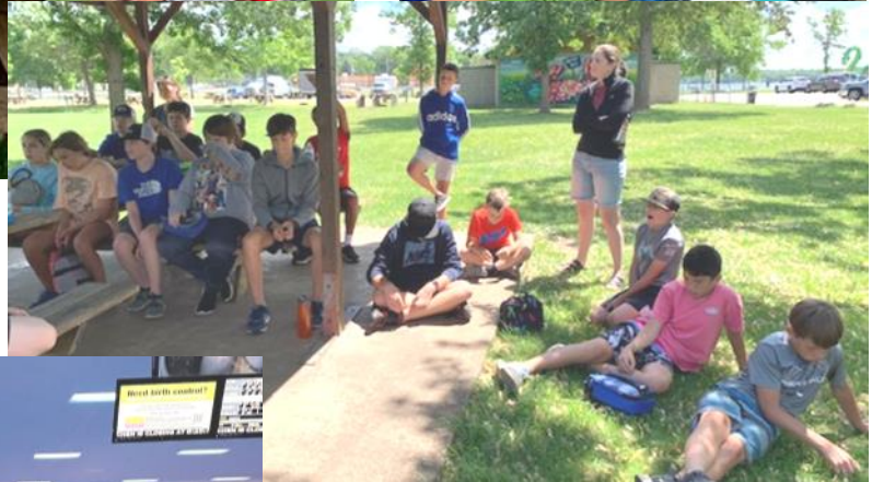
More Summer Stretch!