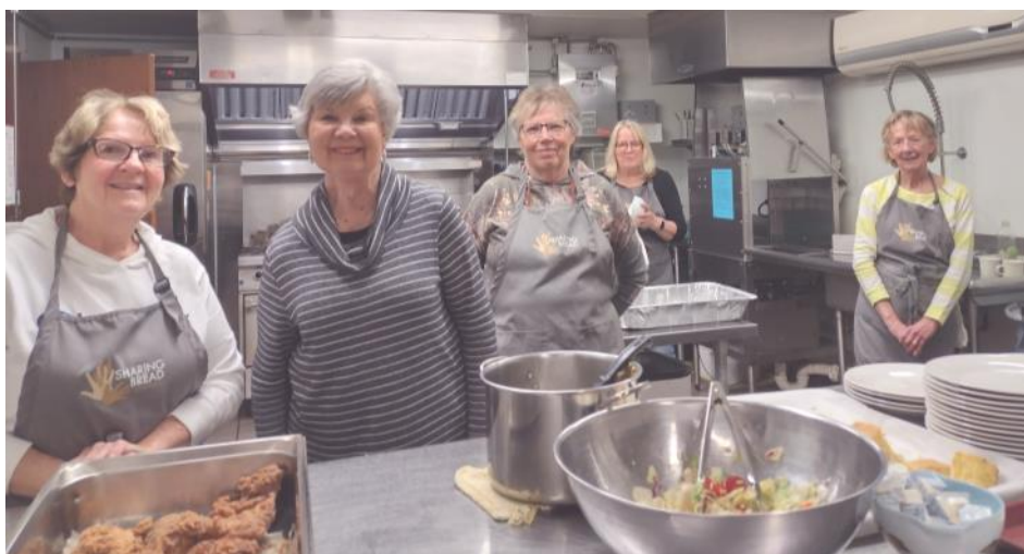
Soul Sisters served 30 guests on June 2nd. Thank you!