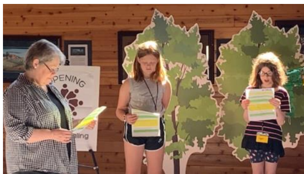
More of ..... "The Healing Tree" VBX.