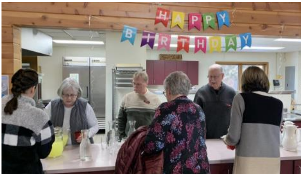
Birthday Sunday Celebration sponsored by the Women of the Cross/ WELCA.