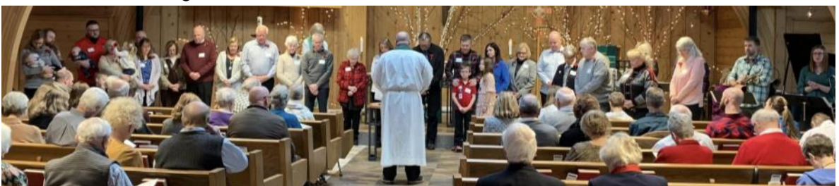
Welcoming new members to the LCC family! Sunday, January 29th.